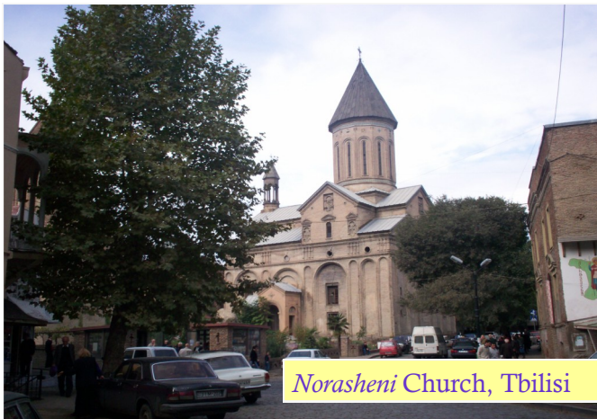
Norasheni Church, Tbilisi