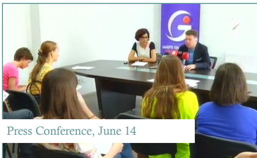
Press Conference, June 14

In order to eradicate ethnic, religious, sexist and homo/transphobic rhetoric in politics and making the Georgian politics healthy, Georgian Democratic Initiative (GDI) and Media Development Foundation (MDF) announced an joint initiative at the press-conference held on June 14: