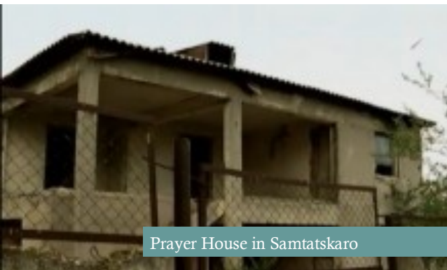
Prayer House in Samtatskaro

Resident of Samtatskaro (no title): “How can we allow them to build a Mosque on this Christian land? We have very good and friendly relations, but we will not allow them to build a Mosque here.”