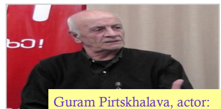
Guram Pirtskhalava, actor: