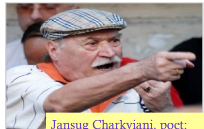
Jansug Charkviani, poet: