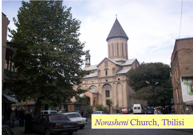
Norasheni Church, Tbilisi